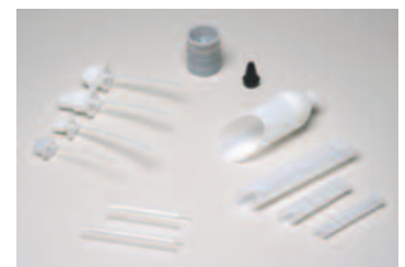
Disposable Bailer Accessories

*Does not contain additive to speed biodegradation.