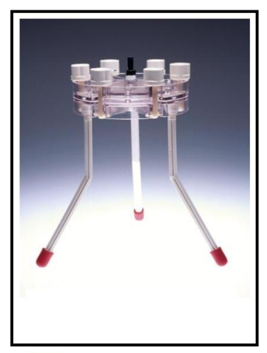
Polycarbonate In-Line Filter Holder