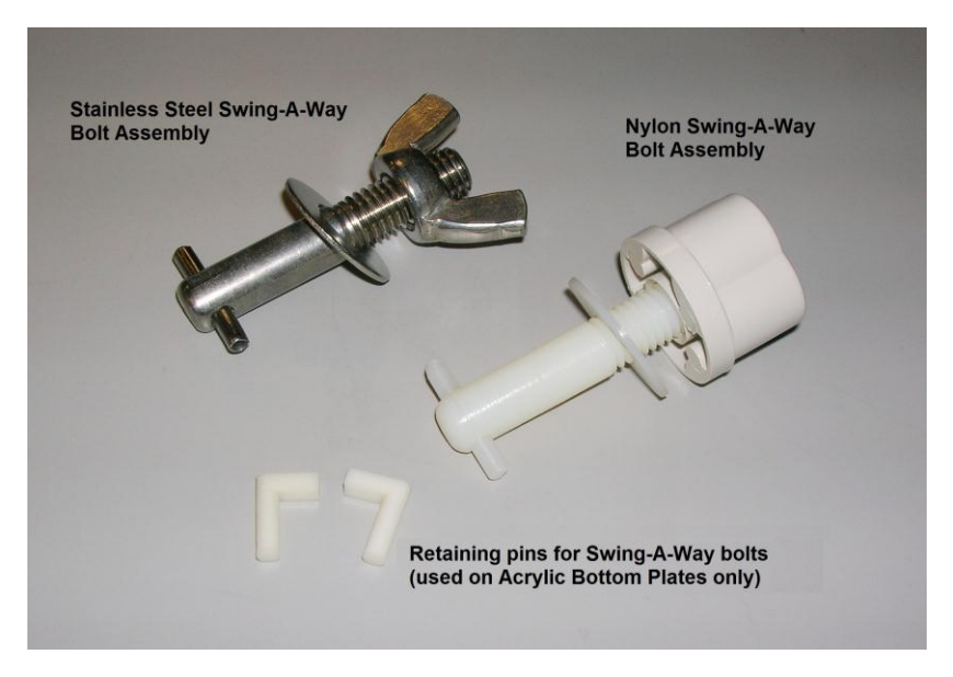
Figure 1-3 – Example of the two kinds of Swing-A-Way Bolt Assemblies.

The following page contains part numbers for Geotech's In-Line Filter Holders.