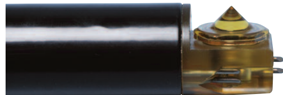
Standard 1" (2.5 cm) Intrinsicly Safe Probe